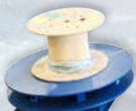
P 0600T 2S