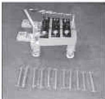
Wire Rope Grip, Capacity: 1 1/2", 2", 2 1/2", 3", 4"