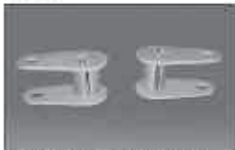
Web Grip, Capacity: 6" and 12" webbing