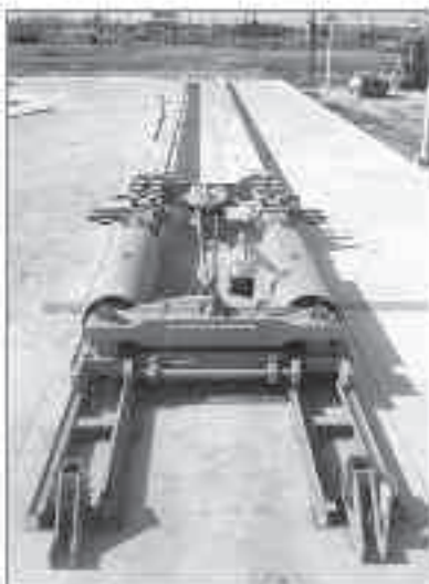
3,000,000 lb. test Bed at Lowery Brothers in New Orleans, LA