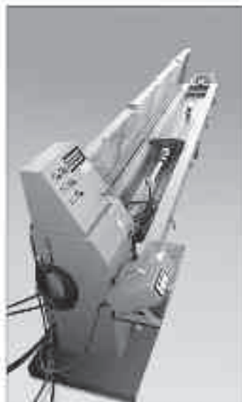
Portable Test Bed with Grip. Capacity: 100,000 lb. - 150,000 lb.; 20', 30' or 40' test length.