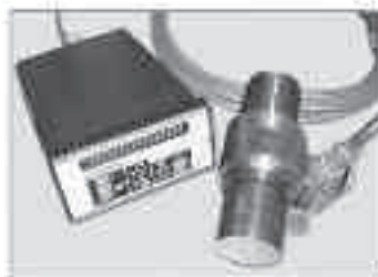
Load cell and Digital Indicator. Load Cell manufactured with 5:1 design factor. Digital Indicator displays pounds of force in a single, clearly visible window.