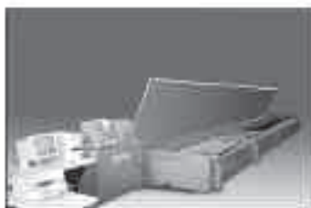
Horizontal Test Bed with Computer system. 150,000 - 3,000,000 lbs.