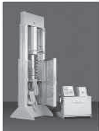
Vertical Break Test Machine. Capacity: 350,000 lb. with 12" Web Grip.