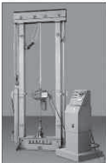
Vertical Test Stand, 50,000 lb. Dynamic testing (load moving) or static testing (load not moving).