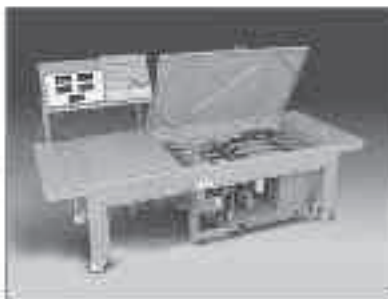
Horizontal Production Machine