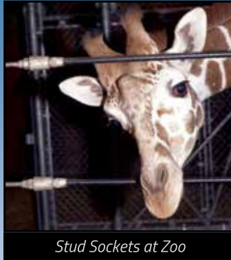
Stud Sockets at Zoo