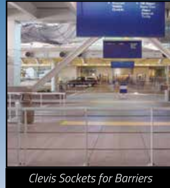
Clevis Sockets for Barriers

Trusted by the U.S. military and used in the maritime, construction, architectural, utility, rigging industries and more.