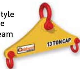
Bail Style Triangle Lifting Beam