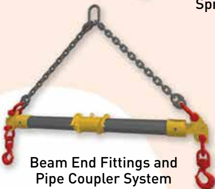
Beam End Fittings and Pipe Coupler System