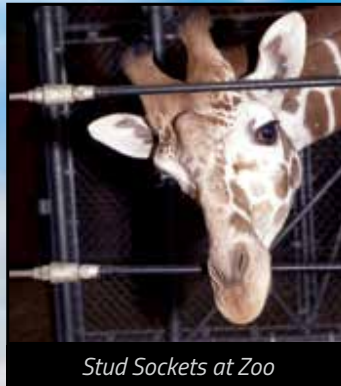
Stud Sockets at Zoo