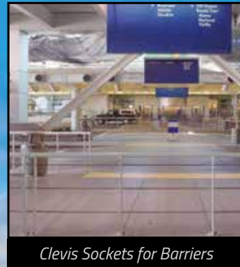
Clevis Sockets for Barriers

Trusted by the U.S. military and used in the maritime, construction, architectural, utility, rigging industries and more.