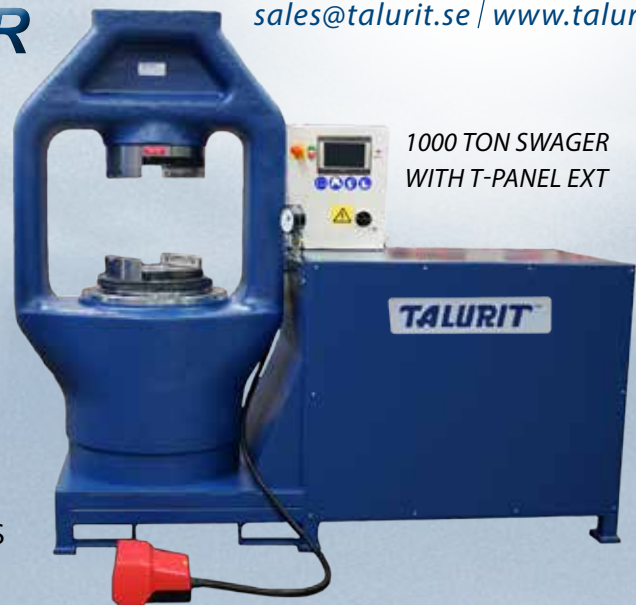
1000 TON SWAGER WITH T-PANEL EXT