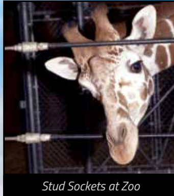
Stud Sockets at Zoo