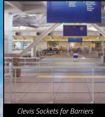
Clevis Sockets for Barriers

Trusted by the U.S. military and used in the maritime, construction, architectural, utility, rigging industries and more.