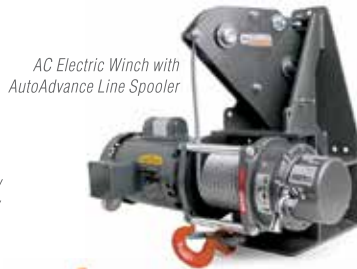
AC Electric Winch with AutoAdvance Line Spooler