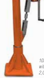
10AAM Davit with Manual Hoist 2,000 lbs. capacity

www.AlliedPower.com Tel 503.626.0654 Beaverton, Oregon