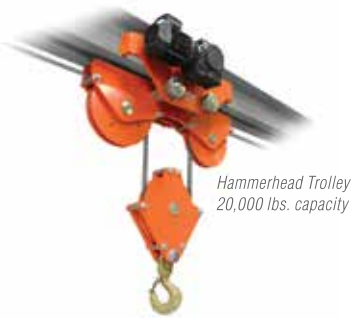
Hammerhead Trolley 20,000 lbs. capacity