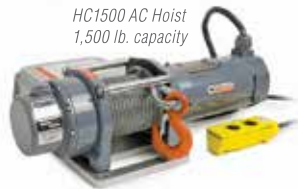
HC1500 AC Hoist 1,500 lb. capacity