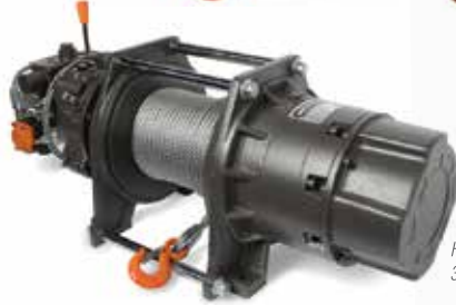
HS1-3500-P 3,500 lbs. capacity