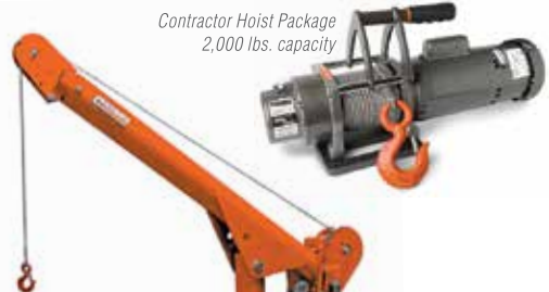
Contractor Hoist Package 2,000 lbs. capacity