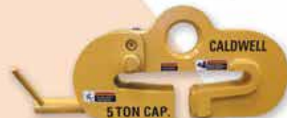
Beam Web Clamp