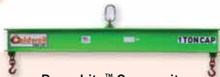
Dura-Lite™ Composite Lifting Beam