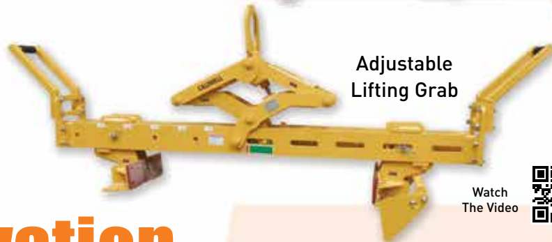
Adjustable Lifting Grab