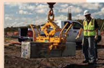
On the job at Florida's Orlando International Airport