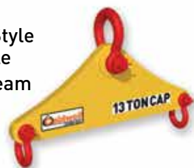
Bail Style Triangle Lifting Beam