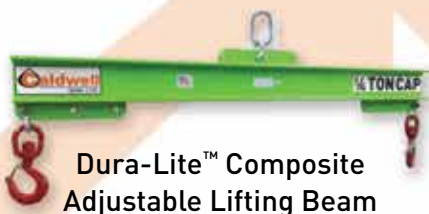
Dura-Lite™ Composite Adjustable Lifting Beam