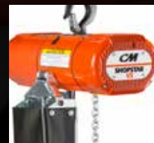
ShopStar VS Electric Chain Hoist