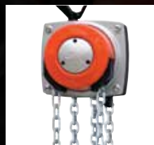
Hurricane 360 ™ Hand Chain Hoist