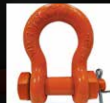
Super Strong Shackles