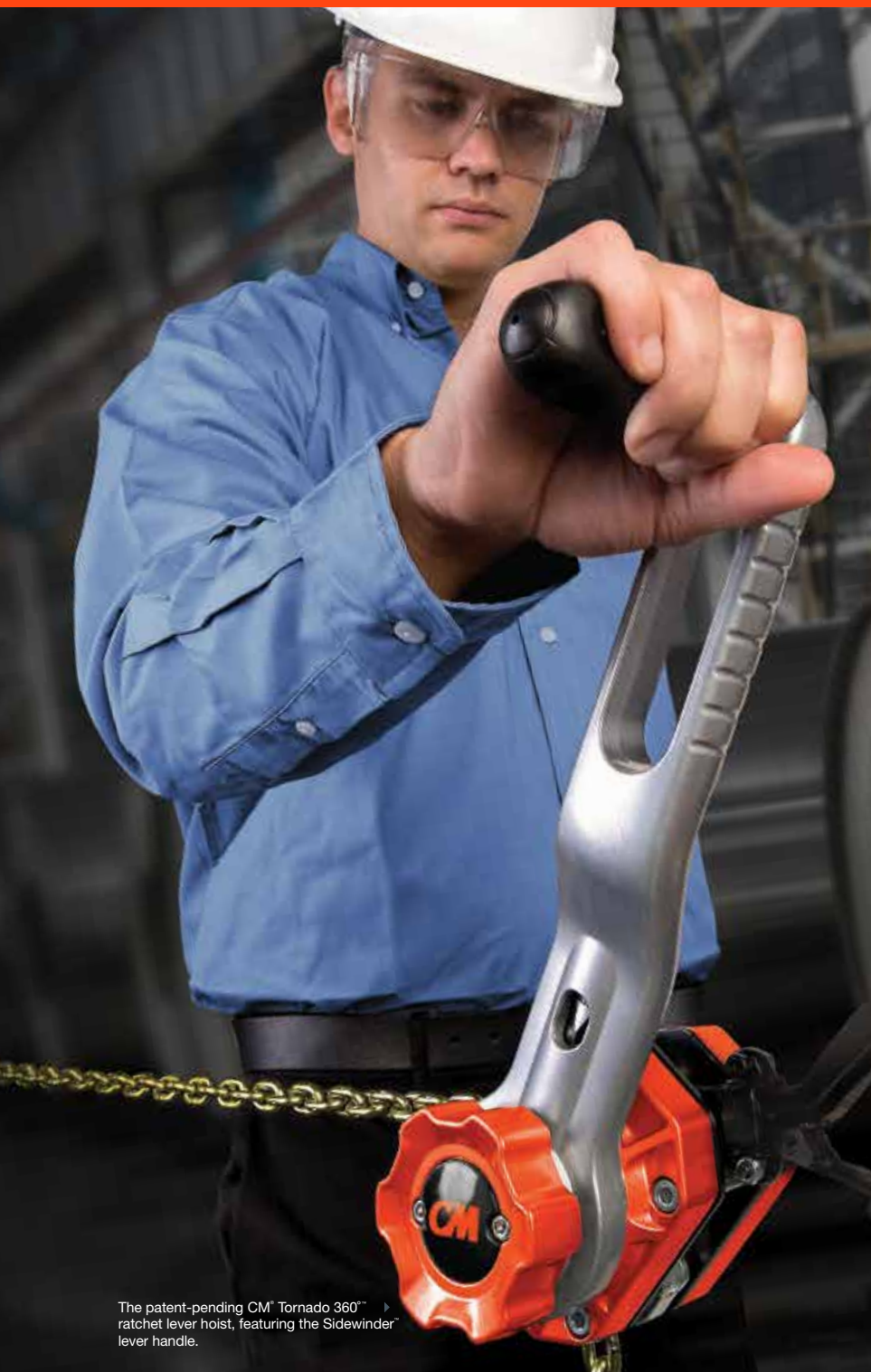
The patent-pending CM ® Tornado 360 ™ ratchet lever hoist, featuring the Sidewinder lever handle.

With unparalleled engineering and manufacturing capabilities, Columbus McKinnon delivers intelligent hoists and rigging products that make good on our company's promise – to help our customers move, lift, position or secure materials easily and safely.